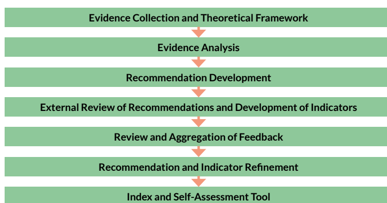
Figure 1. Proposed Methodological process for Coaching Policy Index, Adapted from Geeraert (2018).

Though there are inherent challenges in developing such a composite indicator - for example, risks related to oversimplification, improper recommendations or misinterpretation - such indicators also allow complex issues to be streamlined and facilitate benchmarking as well as policy development (Nardo et al., 2005). From the outset, it is of utmost importance that any such index is based on both sound, current evidence as well as on a solid theoretical and conceptual framework (Geeraert, 2018; Gómez-Limón & Sanchez-Fernandez, 2010). Given those requirements, the PEAK project needs to collect rigorous evidence related to coaching policies in Europe, identify gaps within those policies, and use that evidence to develop recommendations and indicators around a strong, widely accepted theoretical foundation. The research report has already collected extensive data on coaching systems, regulation, women in coaching and volunteering in Europe. The upcoming section presents the theoretical grounding behind policy and good policymaking.